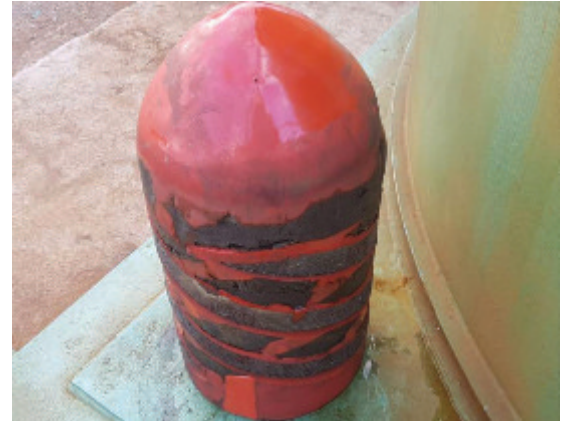
Development of bespoke pigging procedures