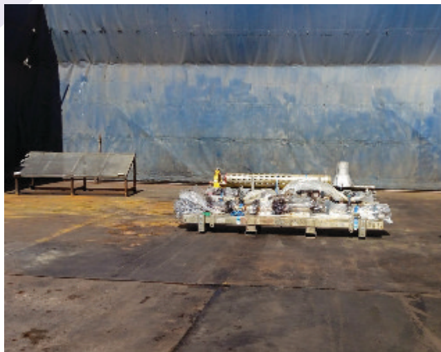
Pig platform prior to cleaning

Inspection planning and feasibility studies; procedure review; HAZID/HAZOP; contractor liaison; project management and on-site supervision.