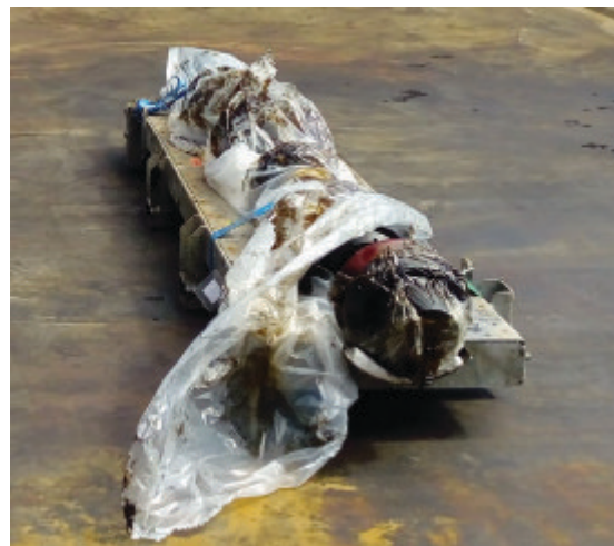
Waste management - cleaning program pigging slug