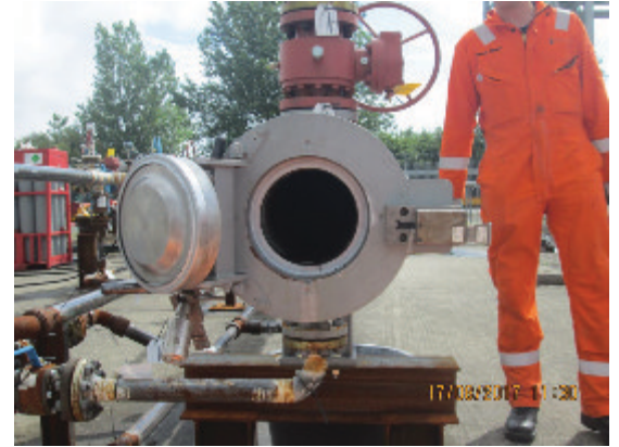
Development of bespoke pigging procedures