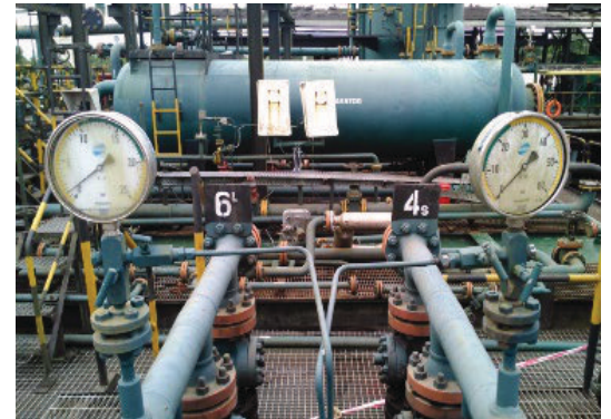
Site Inspection - General Visual Inspection