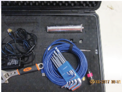
Set up of intelligent pigging units

Activities Pig design ILI tools selection Pumping spread Temporary facilities Temporary valves Pig damage review