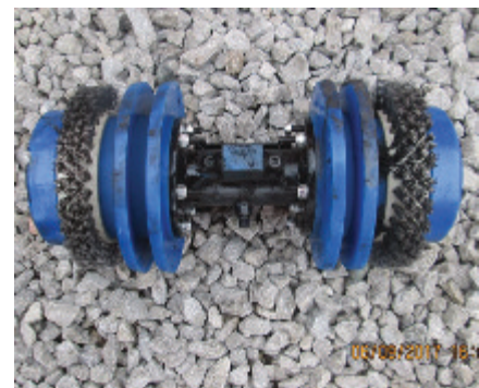
Brush Pig used for operation